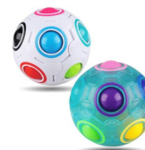
magic ball stress-reliever twelve-sided tactile and logic game sphere